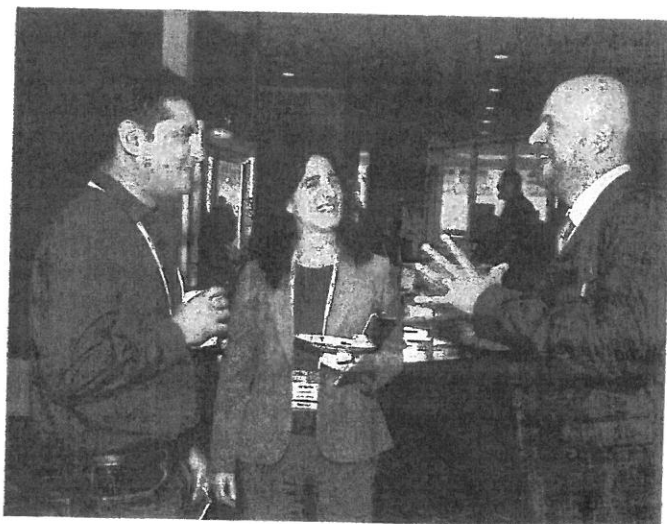
CPS Research Symposium 2016, Seattle